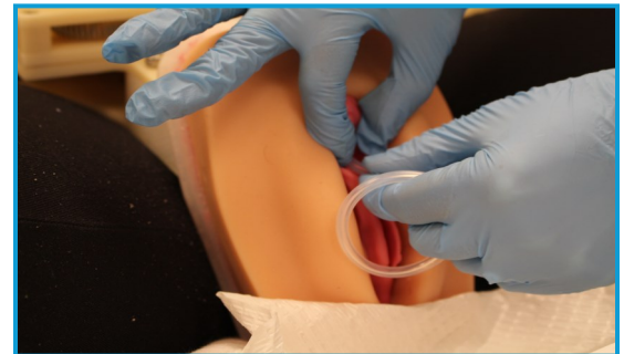
Immersive Simulation: Urinary Catheter