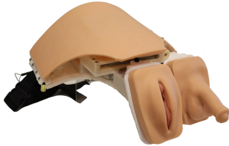
Interchangeable Male/Female Genitalia