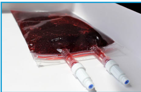
Avkin Antimicrobial Simulated Blood

“These products solve the problem that a lot of us have in simulation. When you practice on a piece of plastic, it’s just not the same experience for the student. ”