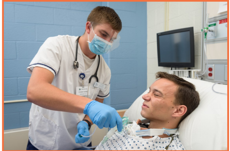
Kankakee Community College: Immersive Simulation